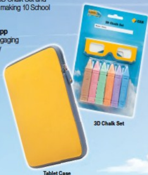
3D Chalk Set

Did you know that approximately one in five parents are trying to teach their children about cashless transactions and digital money management? CommBank research shows parents are alternating between cash and online bank transfers when giving their children pocket money, and actively demonstrating 'tap and go', online banking, mobile applications and how ATMs work. For more information and tips on financial education for kids, visit The Beanstalk on commbank.com.au/beanstalk